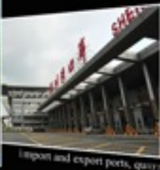
airport and export ports, quays