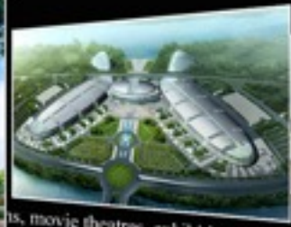
clubs, movie theatres, exhibition centers