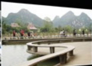
parks, scenic spots