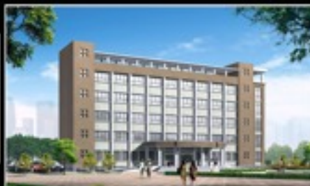
office buildings and industrial plants