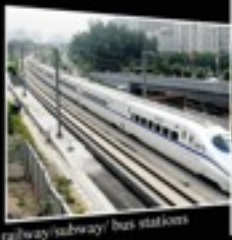
railway/railway bus stations